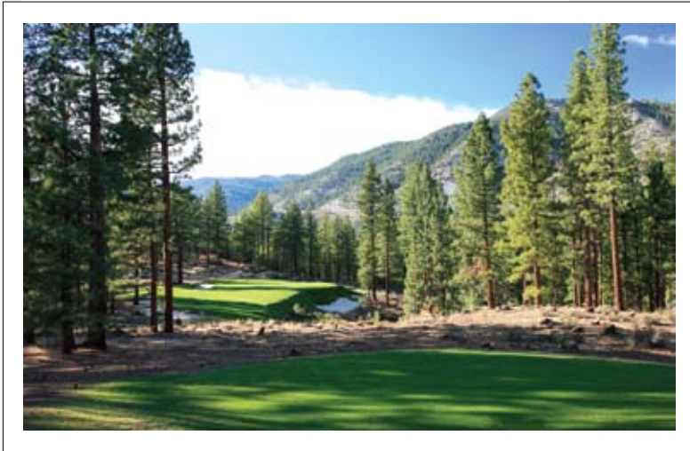
CLEAR CREEK TAHOE CLUB, MINDEN, NEVADA

We're honored by the caliber of clubs and resorts that work with us. They have given us the opportunity to create successful custom programs for every recreational amenity with every conceivable use privilege and nuance. You'll find our clients the world over. What they have in common is the exclusivity of their properties, their innovative offerings, their futuristic positioning, and their demand for excellence. We're looking forward to learning about your project and showing you how we might contribute to your success.