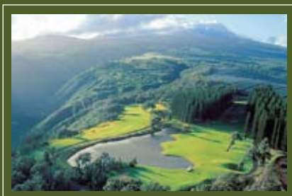
THE KAPALUA CLUB MAUI, HAWAII