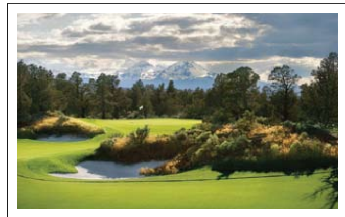
THE PRONGHORN CLUB, BEND, OREGON

Albany Golf & Beach Club - Nassau, The Bahamas Bahia Beach Resort & Golf Club - Rio Grande, Puerto Rico Baker's Bay Golf & Ocean Club - Great Guana Cay, The Bahamas Cabo Del Sol Club - Los Cabos, Mexico Cap Cana Club - Dominican Republic Castiglione del Bosco Club - Montalcino, Italy Chileno Bay Club - Los Cabos, Mexico Club Punta Mita - Puerto Vallarta, Mexico El Dorado Golf & Beach Club - Los Cabos, Mexico El Rio Country Club - Guadalajara, Mexico Jack Nicklaus Golf Club - Worldwide Jack Nicklaus Golf Club Anguilla - Anguilla, British West Indies Jack Nicklaus Golf Club of Canada - Vancouver Island, British Columbia, Canada Jack Nicklaus Golf Club St. Lucia - St. Lucia, West Indies Killeen Castle Golf Club - Dublin, Ireland Loch Lomond Golf Club - Dumbartonshire, Scotland Mercur Park Club - Almaty, Kazakhstan Palmas del Mar Club - Humacao, Puerto Rico Peninsula Papagayo Club - Guanacaste, Costa Rica Punta Brava Club - Ensenada, Mexico Reserva Conchal Club - Playa Conchal, Costa Rica Royal Westmoreland Golf Club - Bridgetown, Barbados, W.I. Sugarhill Club - Bridgetown, Barbados, W.I. The Club at Atlantica - Dominican Republic The Club at Quivira - Los Cabos, Mexico The Club at Seaside Mariana - San Rafael Del Sur, Nicaragua The Kinloch Club - Taupo, New Zealand The Tucker's Point Golf, Beach & Tennis Club - Tucker's Town, Bermuda The Yacht Club at Ocean Club Residences & Marina - Paradise Island, The Bahamas