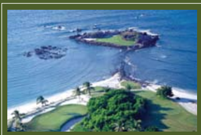
CLUB PUNTA MITA PUERTO VALLARTA, MEXICO